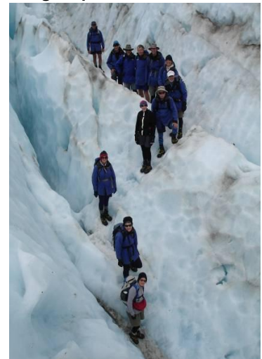
Penguin parade down-ice