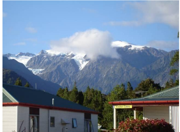
Franz Josef from camp site