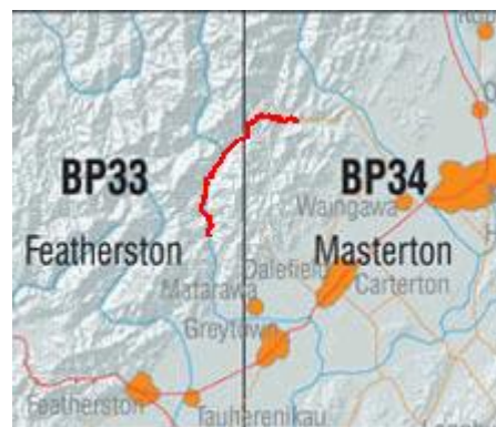
The location of the tramp can be seen above with the route walked shown as the RED line.