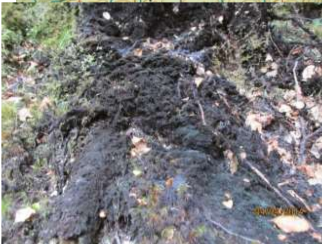
Black exudate loved by wasps