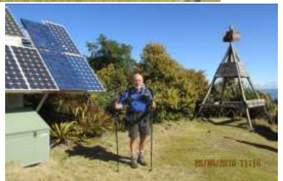
The Trig station has a large communications mast and control hut with explanatory notices.