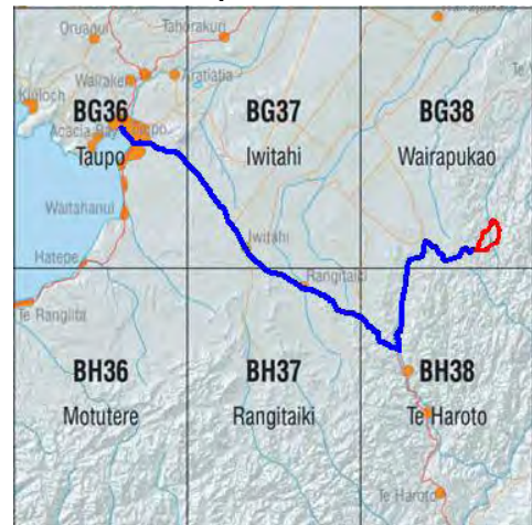
The drive to the start is shown as the BLUE line above The tramp route is shown by the RED line

Depending on time of year, time available and fitness, it is only a few kilometres to head north to the Central Hut but think about this as there is still quite a long way to go outwards passing and visiting the "cave". After the cave it is a bit of a grunt back up the hill to the Plateau Road car-park and overall there are over 700 metres of ascent and descent.